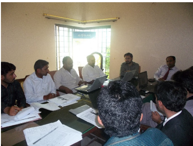
PCE Giving Training on SMP