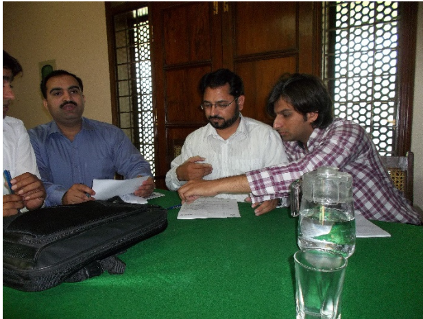
PO Trainer Team